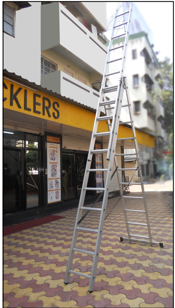
Fig 2: Combination Ladder as a Self Supporting Extension Ladder.