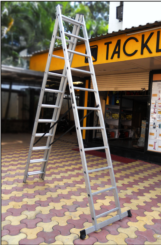
Fig 1: Combination Ladder as a Folding or Step Ladder